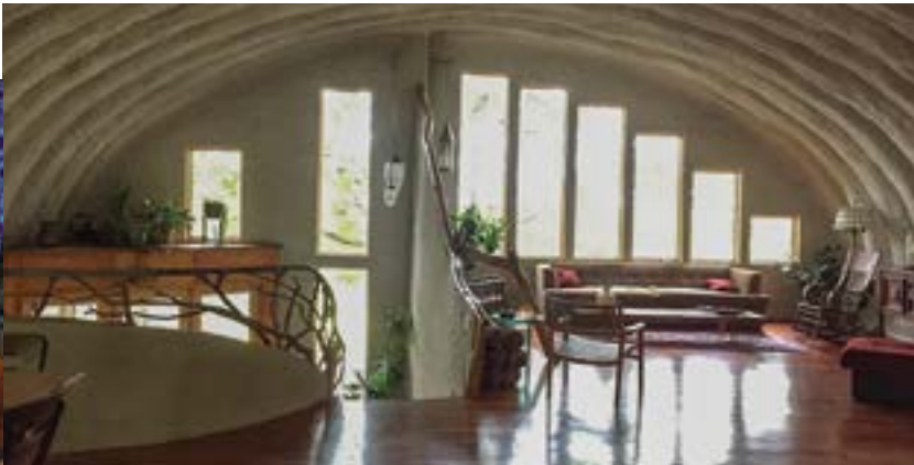
LINDA WEINTRAUB (faculty), Home , prefabricated industrial structure made into super-efficient house on 11 acres of land. New York State.